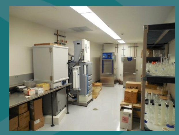
Glasswash / Autoclave